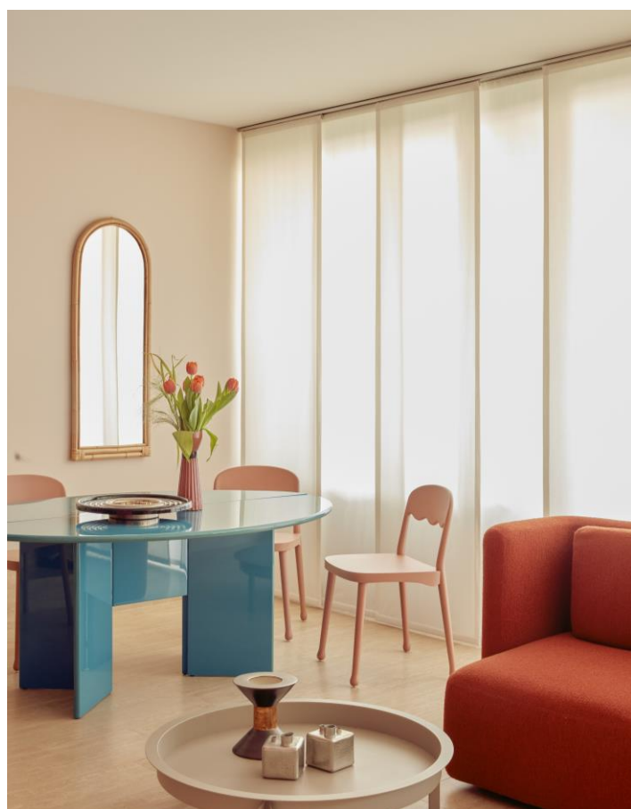
Cristina Celestino for Casa Udine