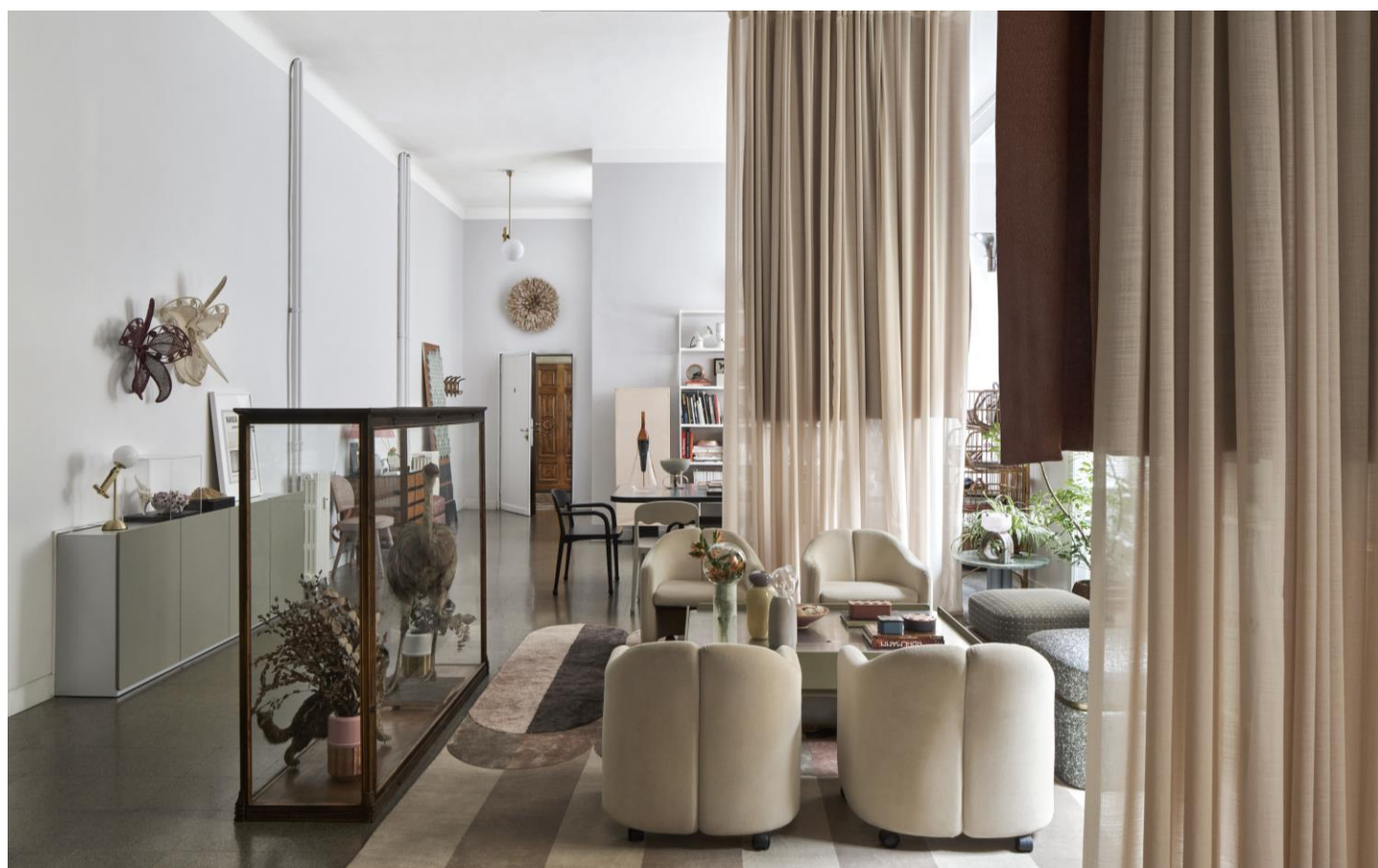
Cristina Celestino Studio